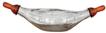
Victorian baby bottle

An artefact is an object from the past. Museums often display historical artefacts. Artefacts can tell us about how people used to live. Everyday objects like baby bottles, clothing, toys and books can tell us about childhood in the past.