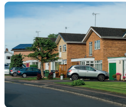
A street today.