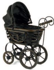
wood and metal pram