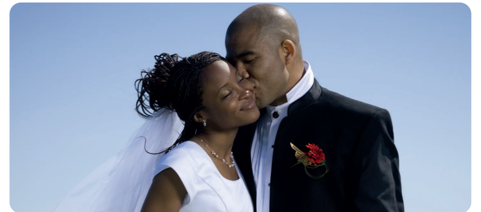
Weddings happen when two adults get married.