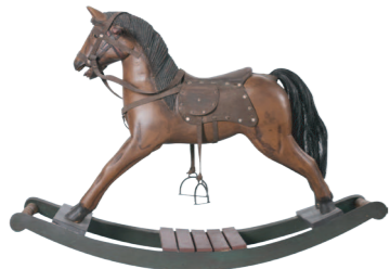
wooden rocking horse