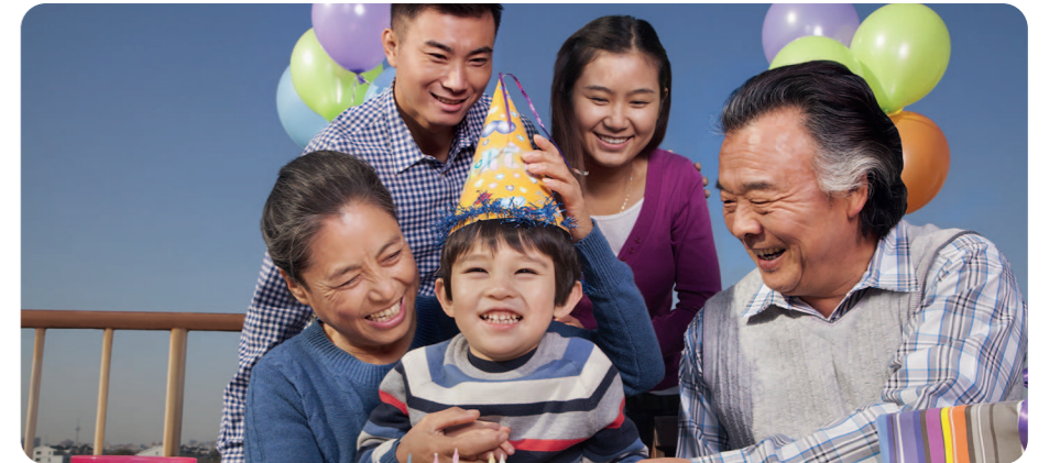
Birthdays happen every year.

Important life events include birthdays, religious festivals or family celebrations. Some life events happen every year and some happen at certain stages of human life.