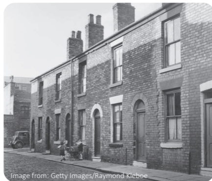
A street in the 1950s.

The way people use land changes over time. For example, in the 1950s there were fewer cars, so fewer roads were needed. Today lots of people have cars, so there are many more roads for people to drive on and driveways for parking.