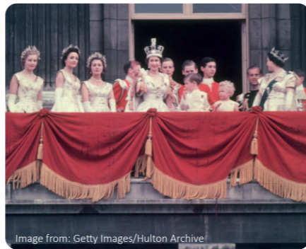
Queen Elizabeth II on her coronation.

A coronation is a ceremony where the crown is placed on the head of the new king or queen. Elizabeth II was the Queen of the United Kingdom for 70 years until she died in 2022. The coronation ceremony of Elizabeth II took place on 2nd June 1953 at Westminster Abbey, London. Many people celebrated the coronation by holding street parties.