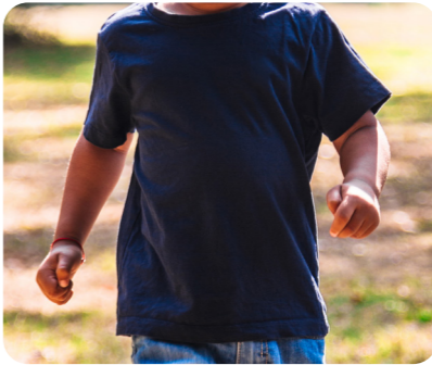
A cotton T-shirt is soft and stretchy.