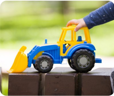
A plastic toy is hard and smooth.