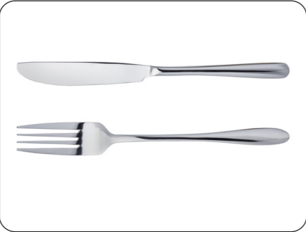
This cutlery is made from metal.