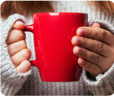
A ceramic mug is hard and waterproof.