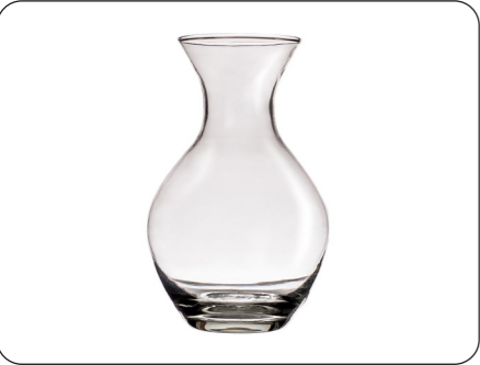
This vase is made from glass.

Materials are what objects are made from. Examples of materials include glass, wood, fabric, plastic, stone and metal. Materials are all around us, such as in the home, garden, school and park. They are important because we use materials to make the objects we use every day.