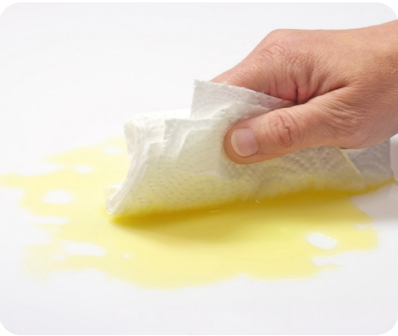
A paper kitchen towel is soft and absorbent.

A property is a quality that a material has. Materials can be described by their properties, such as hard, soft, stretchy, bendy, transparent and waterproof. Materials have different properties, which make them suitable for making different objects.