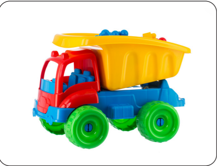
This toy is made from plastic.