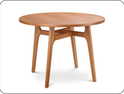
This table is made from wood.