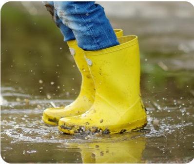
Rubber wellies are waterproof and bendy.