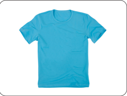
This T-shirt is made from fabric.