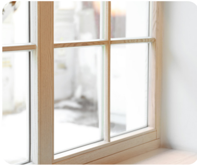
A glass window is hard and transparent.