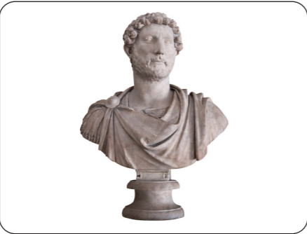
This statue is made from stone.