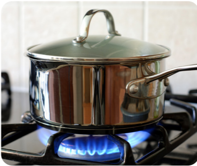
A metal pan is smooth and shiny.