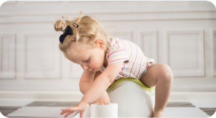
get rid of waste