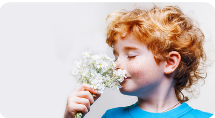
use their senses

Humans are a type of animal called a mammal. Mammals have limbs, such as arms and legs, and hair or fur on their bodies. Other mammals include cats, elephants and apes. All animals, including humans, are living things because they do the following to stay alive: