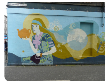
The Gifford Park mural by Kate George, 2015

A mural is a large picture that is usually painted onto a wall, ceiling or other structure.