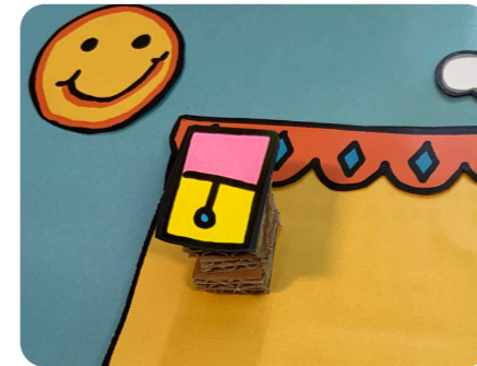
Five layers of cardboard make this window stand out.

Layers of corrugated cardboard can be glued to the back of cut outs to create a 3-D effect.