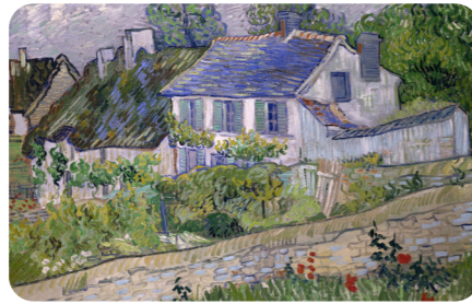
Houses at Auvers by Vincent van Gogh, 1890