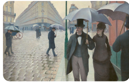
Paris Street; Rainy Day by Gustave Caillebotte, 1890