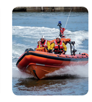
Call 999 in an emergency. Ask for the coastguard and they will call for the lifeboat.