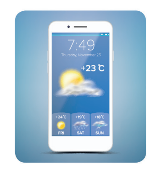
Check the weather forecast for bad weather.