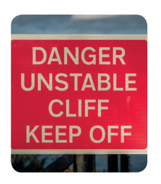
Look for warning signs, follow advice and do not take risks.

The coastline can be a dangerous place. It is important to stay safe and know what to do in an emergency.