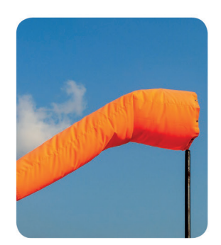
Do not use inflatable toys or airbeds in the sea when a wind sock is blowing.