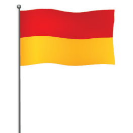
Red and yellow flags mean it is safe to swim.