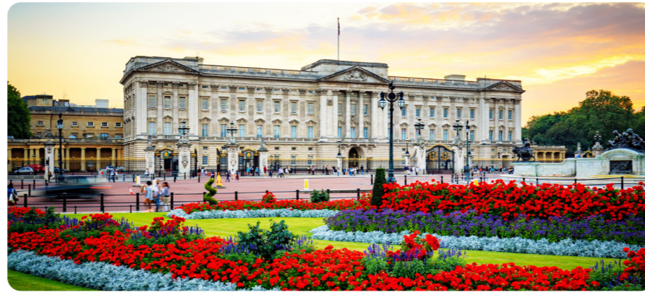
Buckingham Palace is in London, England.

Royal residences include palaces, castles and stately homes. Some of them are used for official royal business. Some are used as holiday or private homes. Many are tourist attractions.