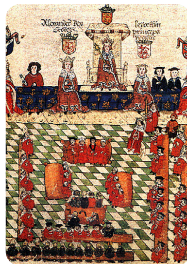
Edward I and the Model Parliament

The power of the monarchy has changed over time. In the past, some monarchs had absolute power. This meant that they could do whatever they wanted. Today, there is a constitutional monarchy. This means that the monarch is controlled by parliament and the government.