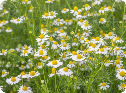
Daisies grow in meadow habitats.