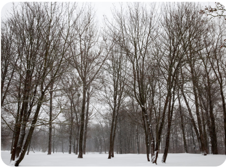
deciduous trees in winter

Trees can be deciduous or evergreen. Deciduous trees lose their leaves in autumn and have bare branches in winter. Evergreen trees shed old leaves and grow new leaves all year round, which means they keep their leaves in winter.