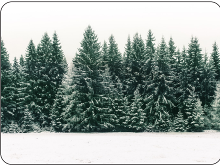
evergreen trees in winter