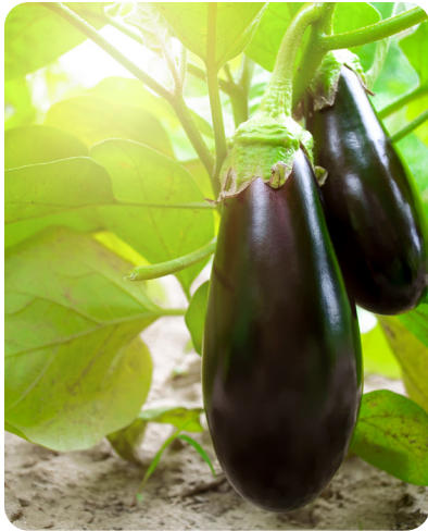
healthy aubergine plant

Plants need space to grow. If an area is overcrowded, the nutrients and water in the soil are used up. Overcrowding also blocks sunlight.