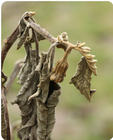
unhealthy aubergine plant