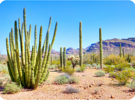
Cacti grow in desert habitats.

Plants are living things that change with the seasons. They grow in different habitats.