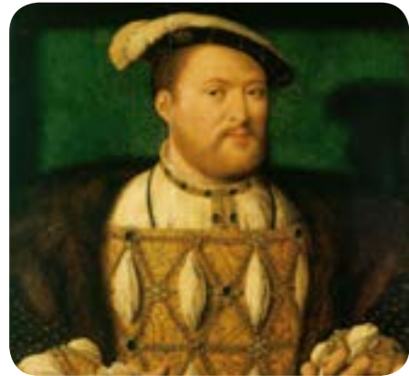
Portrait of Henry VIII by Joos van Cleve, c1530–1535

A portrait is a painting or photograph of a person. It usually shows their head and shoulders, but may show their whole body. Before cameras were invented, kings and queens often had official portraits painted to show how powerful and important they were.