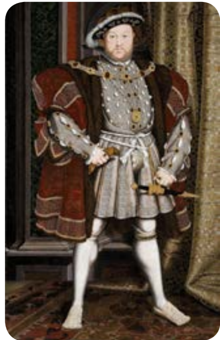
Henry VIII by Hans Holbein the Younger, 1537–47