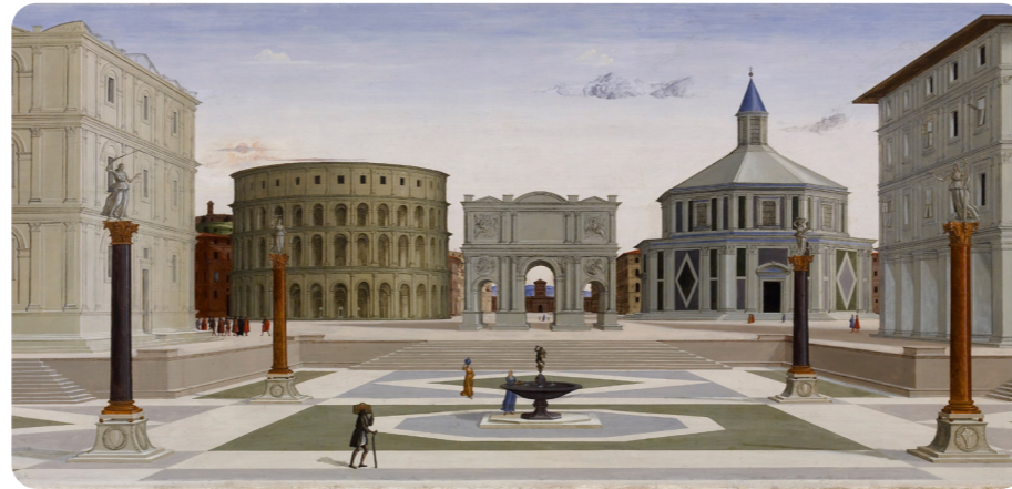
The Ideal City by Fra Carnevale, c1480–1484

Urban landscapes are drawings of towns and cities shaped by the people and buildings found there. Different atmospheres are created using bright, dark or muted colours and sharp or blurry lines.