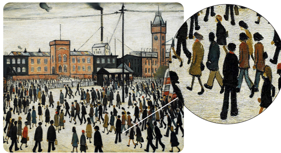
Going to Work by LS Lowry, 1959