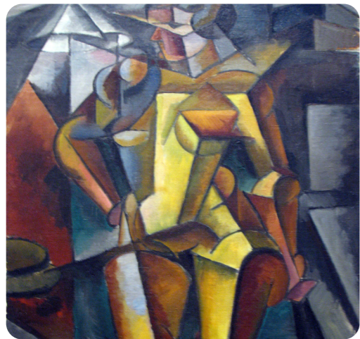
The Model by Lyubov Popova, 1913