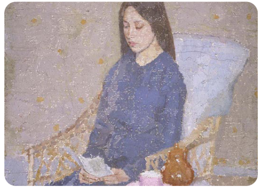
The Convalescent by Gwen John, c1923

The artist's interest in the human form has endured for thousands of years. Representations of human figures have been discovered from prehistoric cave paintings right through history until the present day. These figures can inform us about the cultural, religious or everyday life of different societies. Pictures of human figures can be figurative, abstract or photographed.