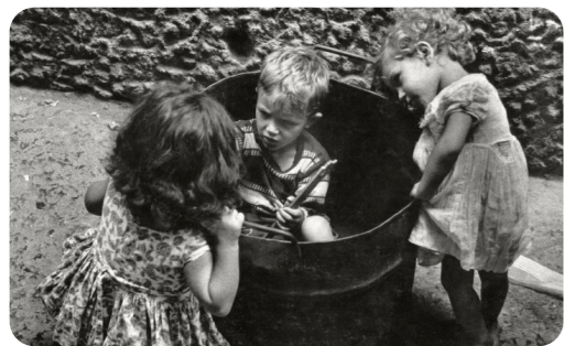
Naples, Italy – Children by Herbert List, 1961