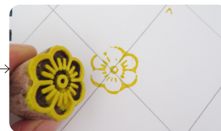
Press the block onto a piece of paper or fabric.