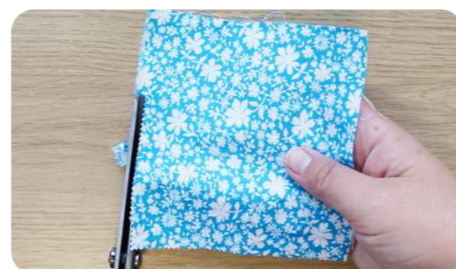
Trim the edge of the fabric with pinking shears.

A hem runs along the edge of a piece of cloth or clothing. It is made by turning under a raw edge and then sewing to give a neat finish to the fabric and to stop it from fraying.