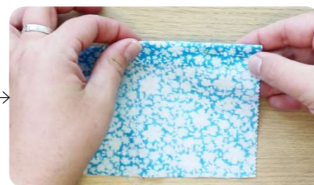
Turn the edge of the fabric over to make a 1.5cm hem. Pin it in place.