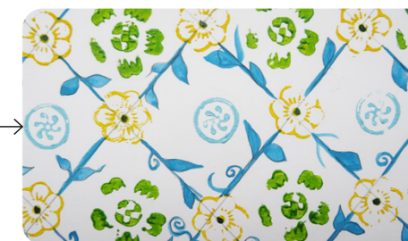
Repeat with other blocks and colours until the pattern is complete.