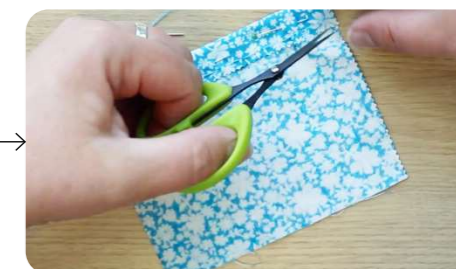
Tie a knot at the end of the hem and cut the thread. Iron along the crease to flatten the hem.