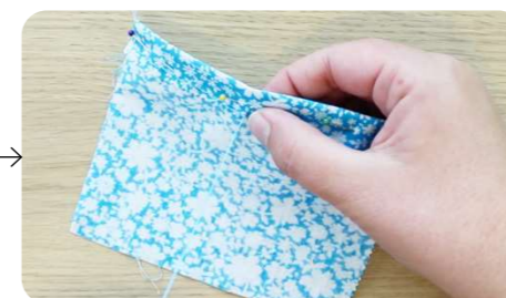
Use a needle and thread to sew running stitches along the hem.