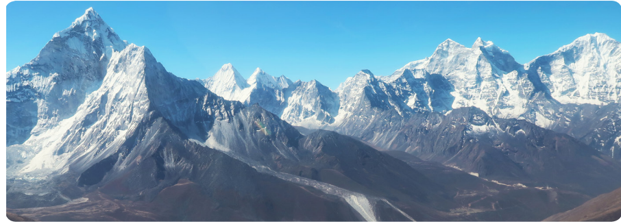
Himalayas mountain range

A mountain is a large, raised part of the Earth's surface. A mountain's highest point is called its peak or summit. Mountains are at least 610m in height. A mountain range is a chain of mountains that are close together. They are usually arranged in a line connected by ridges.