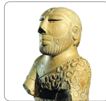
Indus Valley statuette