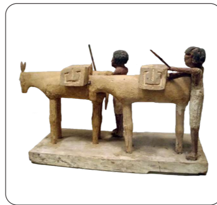
Ancient Egyptian figurines

The making of statues, statuettes and figurines is an ancient craft. It was an important part of the culture of past civilisations, including ancient Sumer, ancient Egypt and the Indus Valley. The sculptures made by these civilisations include important people, such as monarchs and religious deities. They also tell us about the everyday lives of the people who were part of these ancient civilisations and the things that were important to them.