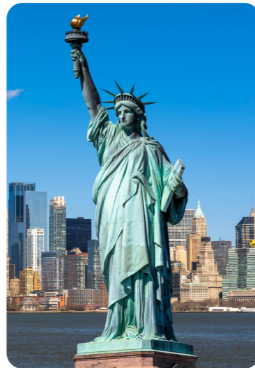
Statue of Liberty ( Liberty Enlightening the World )

A statue is a three-dimensional representation of a person, animal or mythical being. It is usually the same size as the person or animal in real life or much larger. Most statues are displayed outdoors, so artists make them from durable materials, including stone or metal, such as marble or bronze.