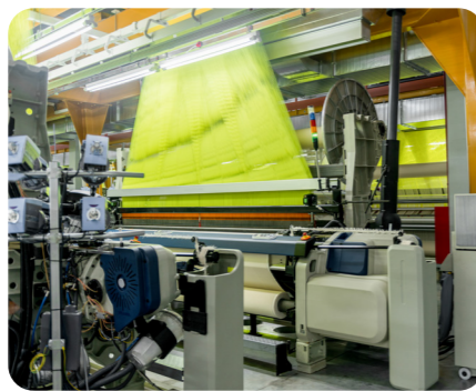
modern electric loom