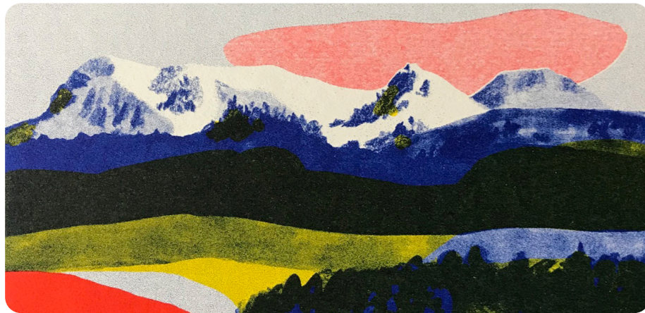
Mountains by Fanny Dreyer, 2019

Collage is art in which pieces of paper, photographs, fabric and other objects are arranged and stuck down onto a supporting surface or background. Collages can be abstract or pictorial.