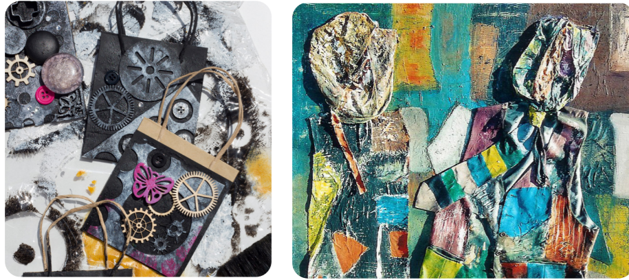
mixed media collages

The term 'mixed media' describes artwork that uses more than one medium, such as paper, fabric, photographs and 3-D objects, like buttons. Collage is a type of mixed media art.