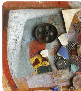
Merz Picture with Porcelain Fragments by Kurt Schwitters, 1945–1947

The German artist, Kurt Schwitters, lived from 1887–1948 and is famous for his mixed media collages called 'Merz pictures'. Artists who create mixed media collages use different joining methods, including gluing, stitching and tying.