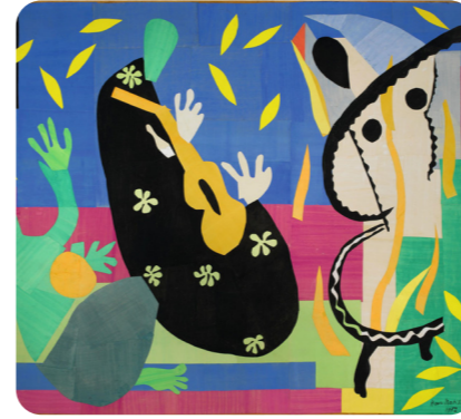
Sorrow of the King by Henri Matisse, 1952

Paper collages are made by gluing different types of paper to a background. The paper used to make a collage can be torn, folded, crumpled or layered to create interesting textural effects. Henri Matisse is well known for his collage art.