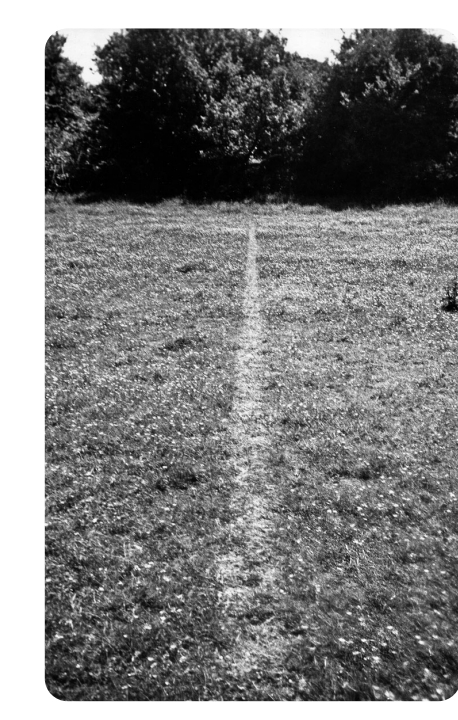
A Line Made by Walking by Richard Long, 1967

Land art can be made from many materials. Some artists sculpt the land into pieces called earthworks. Other artists use natural materials, such as twigs and rocks, to make sculptures within the landscape. Land art may be temporary, such as A Line Made by Walking. Richard Long made this line in the grass by repeatedly walking backwards and forwards.