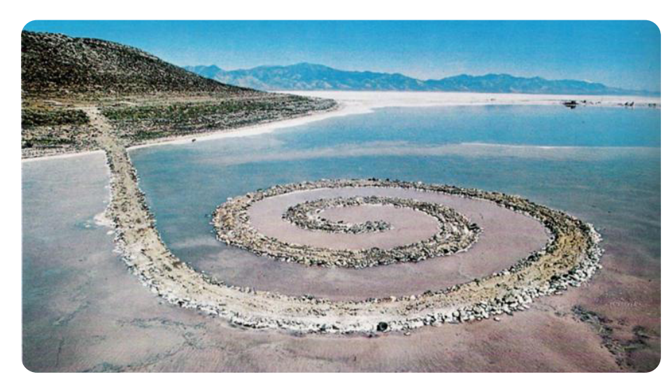
Spiral Jetty by Robert Smithson, 1970

Land art, or Earth art, is art that is made within the landscape. Land art is usually captured using photography because it is temporary and often made on a large scale.