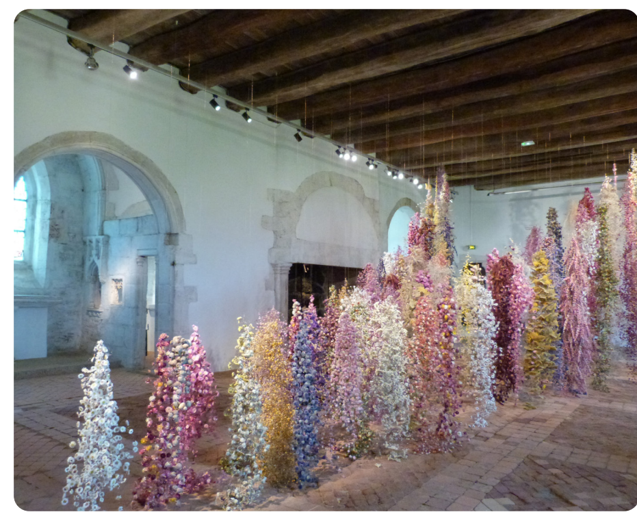
Banquet by Rebecca Louise Law, 2019

Some land artists bring materials inside from the outdoor environment to create installations in galleries and exhibition spaces.