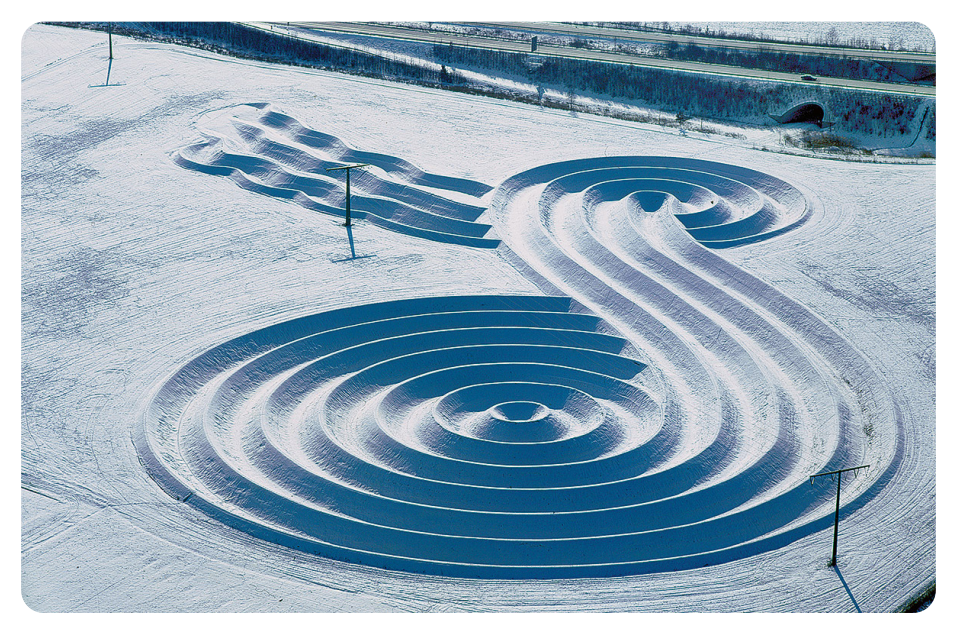
Earth Sign by Wilhelm Holderied, 1995

A relief sculpture projects from a flat surface. A high relief sculpture clearly projects out of the surface and looks like it is freestanding. A low relief, or bas-relief, sculpture does not project far out of the surface and is visibly attached to the background.