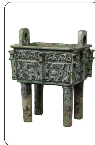
Bronze ritual vessel, c1600–c1046 BC