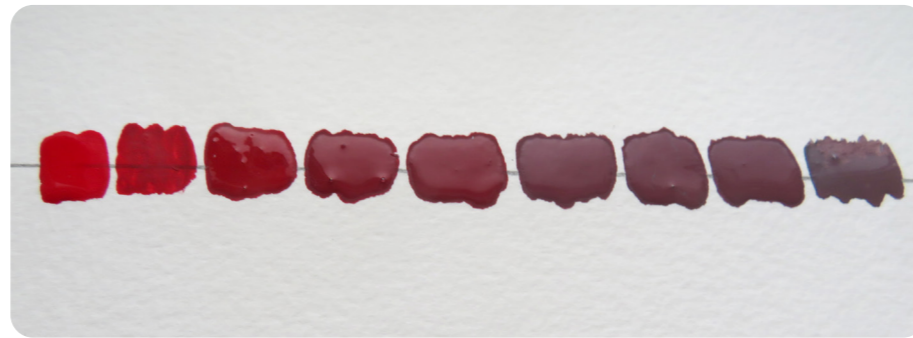
tones of red

A tone is a colour mixed with grey. Tones are less vibrant than the original colour. Using a tonal colour in a painting balances other intense colours and bright hues. When mixing a tone, begin with the pure colour and add grey paint a tiny bit at a time.