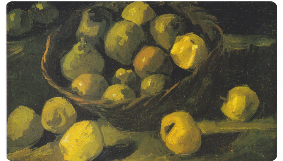
Still Life with Basket of Apples by Vincent van Gogh, 1885

Tints and shades are used in paintings to create light and shadow. This painting by Vincent van Gogh is a good example of the use of tints and shades. The apples in the foreground are painted in tints of green to emphasise light. The apples in the background are painted in shades of green to show that they are in the shadows.