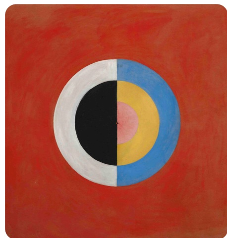
This painting, by Hilma af Klint, is called The Swan No. 17 . The subject matter has been reduced to pure shape and colour. Without knowing the title of the piece, the viewer would not know that the painting represents a swan.

Abstract art takes recognisable objects or forms and changes them until they no longer look realistic. Abstract art allows artists to freely communicate their ideas in a way that is not limited by reality. The artist may leave out details, change the point of view, exaggerate the size, distort the shapes and colours or twist and simplify forms.