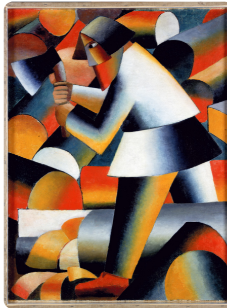
Some artworks reduce their subject matter to basic shapes, such as The Woodcutter by Kazimir Malevich.