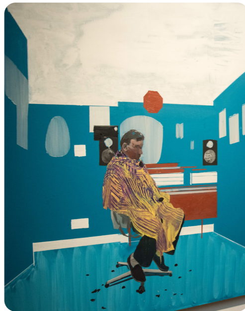
Peter's Sitters 3

Peter's Sitters 3 (2009) by Hurvin Anderson connects his Caribbean heritage with life in England. Colour symbolises his Caribbean heritage, while the barbershop symbolises an important aspect of life in England to Afro-Caribbean immigrants.