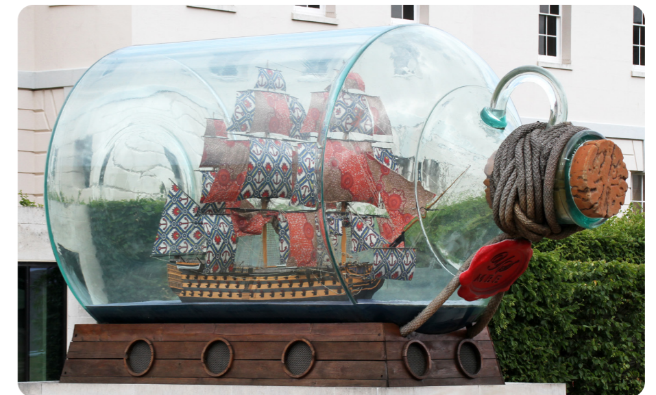
Nelson's Ship in a Bottle

Nelson's Ship in a Bottle (2010) by Yinka Shonibare was the first commission for Trafalgar Square by a black artist. It symbolises and celebrates the story of multiculturalism in London.