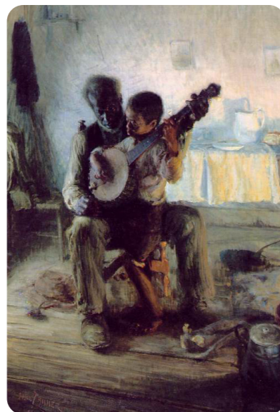
The Banjo Lesson

The Banjo Lesson (1893) by Henry Ossawa Tanner shows an elderly man teaching a young child the banjo, symbolising the resilience, intellect and caring nature of the once enslaved African American people.